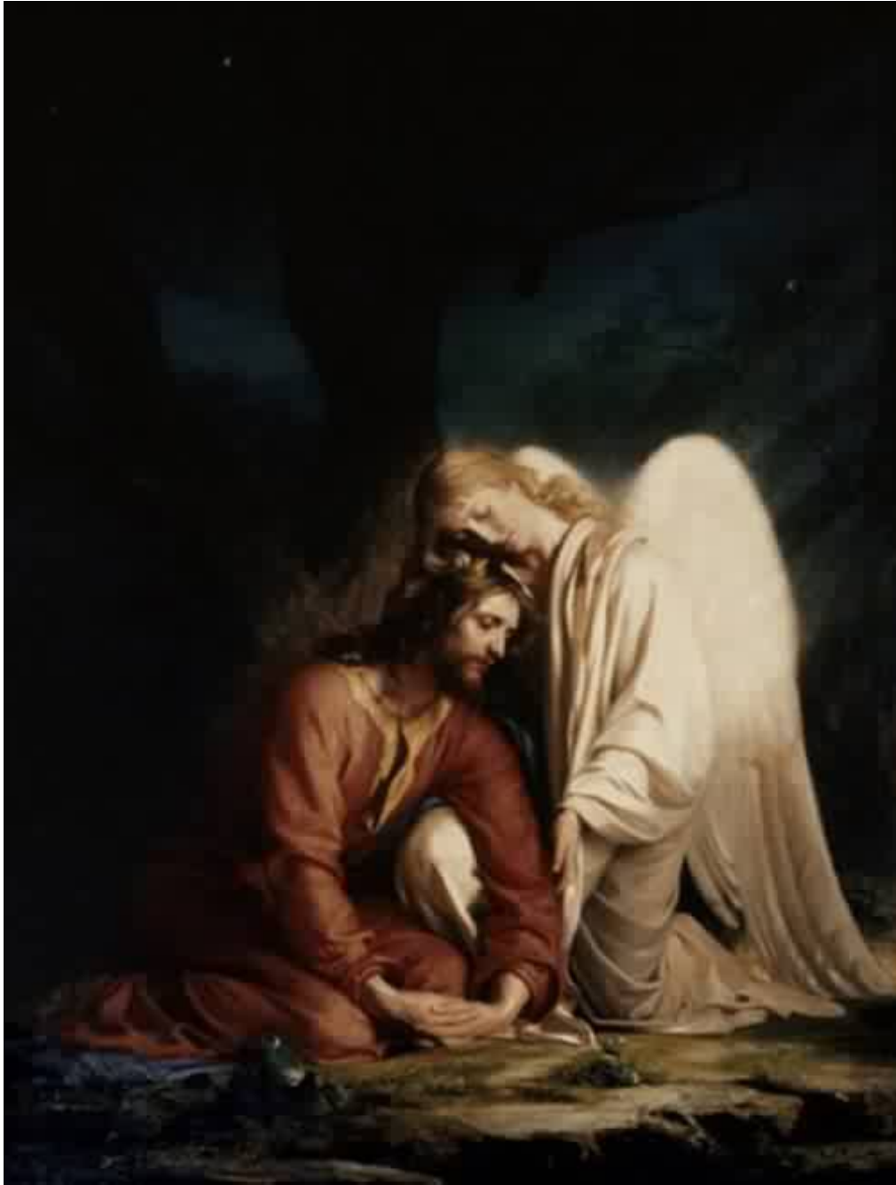
Christ being comforted by an Angel in the Garden of Gethsemane